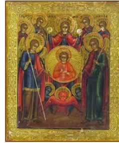
Archangel Michael and the Bodiless Powers of Heaven

Please pray for vocations to the Holy Priesthood!