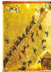
Ladder of Divine Ascent