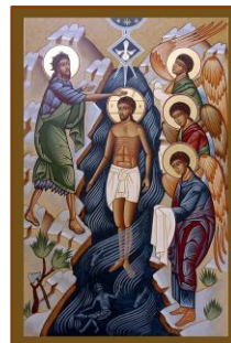
Theophany of our Lord and Savior Jesus Christ

Keep up on OCA news by visiting www.oca.org , diocesan news and directives by visiting www.nynjoca.org , and parish news by visiting www.orthodoxbrick.org .